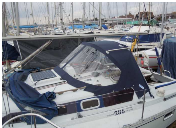
Sprayhood with grab handles

To starboard is a massive locker (another cabin on charter versions), and across the stern a lazerette with lift off lid/seating which houses the gas cylinders and further storage. Aft is a sugar scoop stern (the “special”) with a fold down ladder and mount for the emergency outboard.