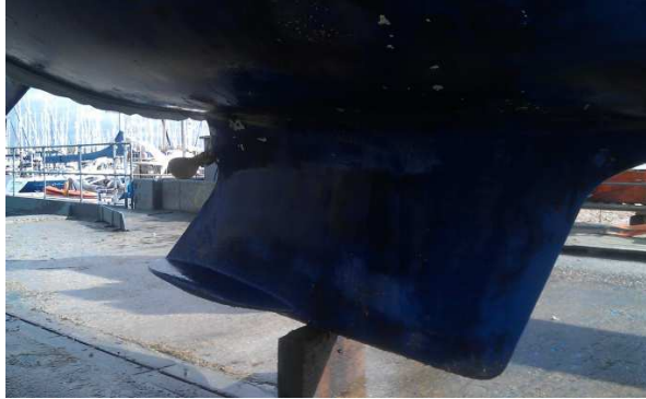
Brunton Autoprop and Spurs ropeclutter